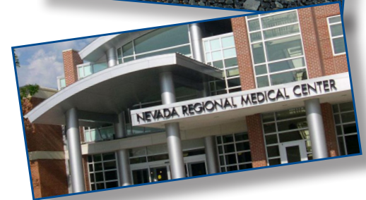
CBCO began providing blood to North Arkansas Regional Medical Center (top) in Harrison, AR, and Nevada Regional Medical Center in Nevada, MO, in the first quarter of 2015.