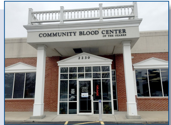
Reser Donor Center