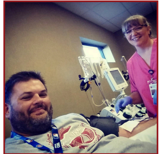
Plasma is collected using the apheresis process, in which plasma is removed from the donor's blood and then the red blood cells are returned to the donor.

AB donors represent only 4% of the population, which means the supply of AB Plasma must constantly be replenished to meet the needs of the 40 hospitals that CBCO serves.